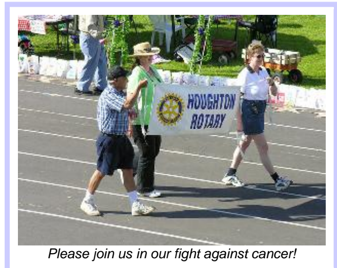
Please join us in our fight against cancer!