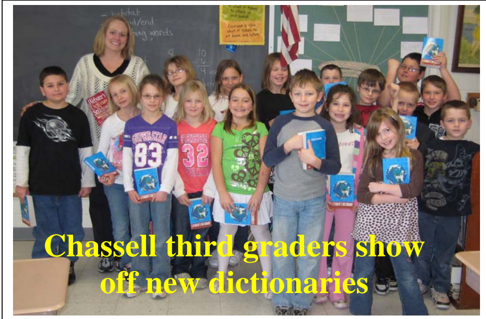
Chassell third graders show off new dictionaries

Page 3 President's Corner Rotary Directors & Officers Where Clubs Meet